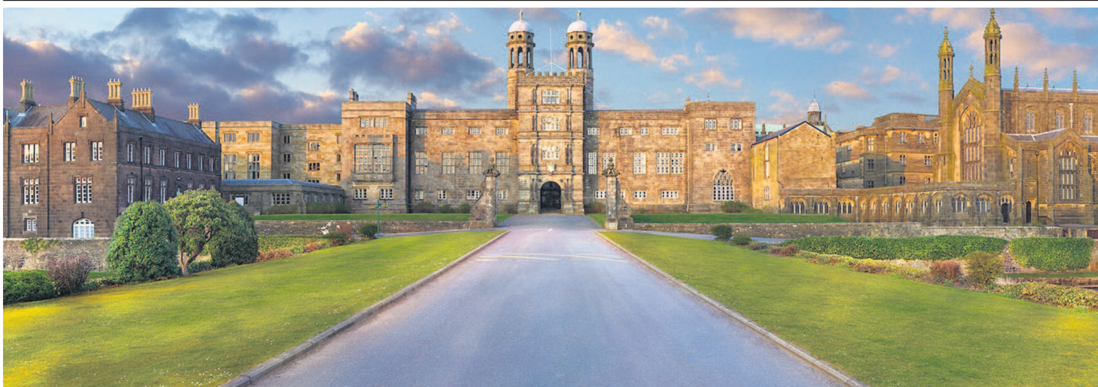
Stonyhurst Christian Heritage Centre has created two walking trails, including the Tolkien Trail, below right, inspired by the work of Catholic author of The Hobbit and Lord of the Rings JRR Tolkien, below left